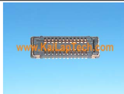
Ответный соединитель Деталь No. WP7A-S024VA1

Ответный разъем на основной плате. Продано отдельно.